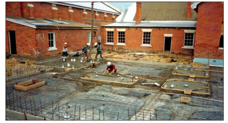
Restoration includes theatre, library and museum.

Tenterfield – A Federation Town – has created a year long calendar of events to celebrate the Centenary of Federation and to reaffirm the town's historic significance as the Birthplace of the Nation.