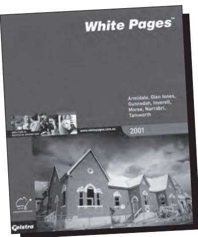
Hutchies' restoration work in Tenterfield features on the front page of the local telephone directory.