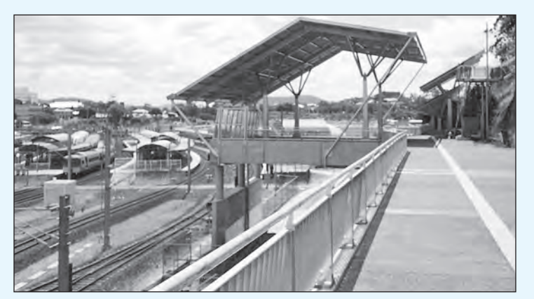
Roma Street redevelopment Package 31 – one of the shade canopies in the package incorporating roof truss structure, offices, aggregate and structural steel shade canopies.

The project consists of a new gaming lounge and toilet upgrade worth $560,000.