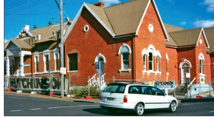
Hutchies' experience of working on heritage listed buildings helped win the contract for restoration of the School of Arts in Tenterfield, New South Wales.

Hutchies were awarded the contract from a select list of